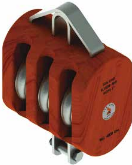
No Fitting (NF)