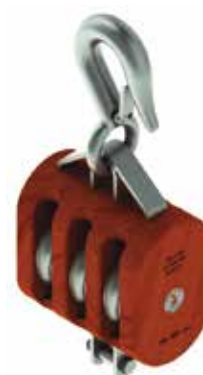
Eye Hook (H)