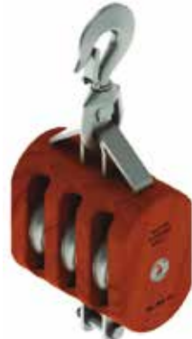
Swivel Hook (SH)