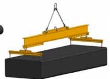
Four Point Lifting System