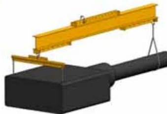
Three Point Lifting System