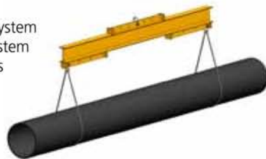
Two Point Lifting Beam